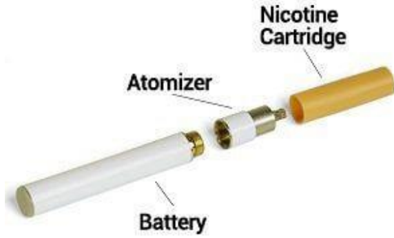
Cartridge Style E-Cigarette